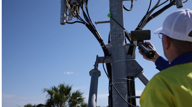
PIM Finder in action