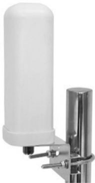
78712043 Cubic Column